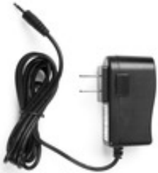
R157 - AC Adapter AC Adapter